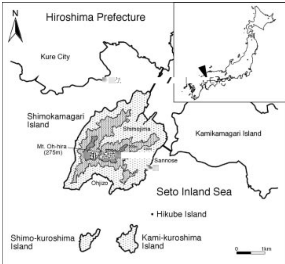
Fig. 1. Map showing the study area. The three altitudinal zones are (◻): <100m, (▨): 100-200m, and (■): >200m.

Shimokamagari Island was connected with Honshu by the Akinada Bridge in 2000, and the municipality was absorbed by Kure City in 2003.