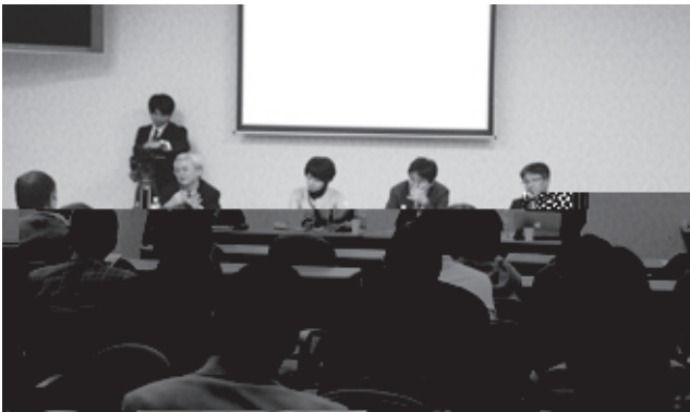
パネルディスカッション Panel Discussion