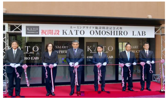
KATO OMOSHIRO LAB